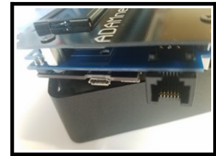
Figure 1: ADE Pro Micro-USB